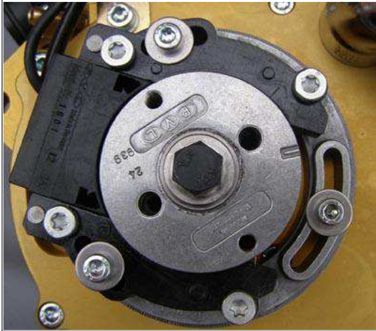
Position of PVL Ignition in top position with the stop screw in the front crankshaft