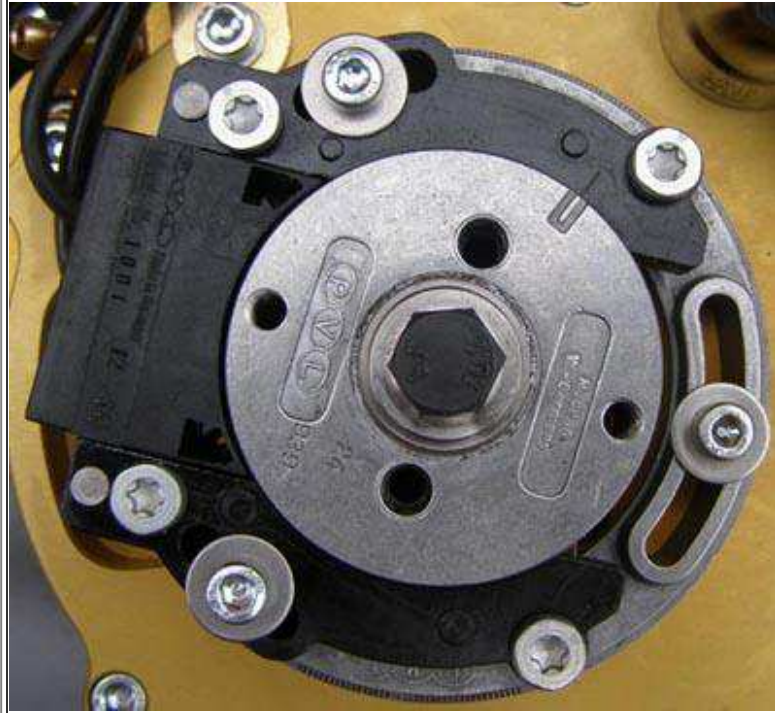
Position of PVL Ignition 5,8 mm. BTDC